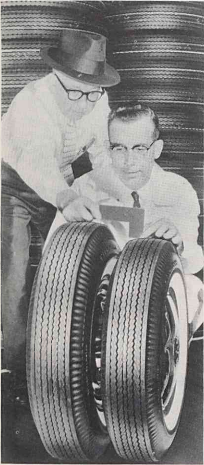
13-INCH TIRES for the new American compact cars and for foreign cars were among the new or improved products introduced last year.