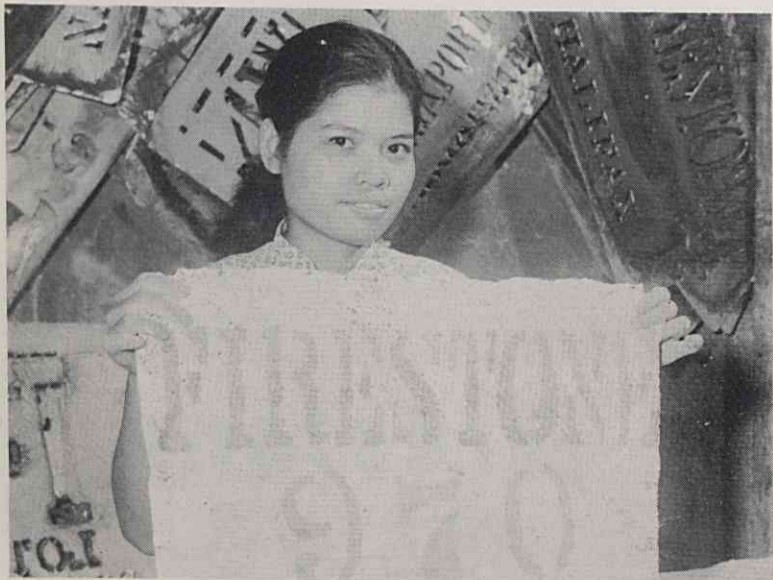
AMONG THE WORLD-WIDE operations of the company is the plant in Singapore which celebrated its 40th anniversary last year. Above, an Asian stencil girl at the Singapore plant shows her handiwork which identifies the contract number and the destination for a bale of natural rubber.