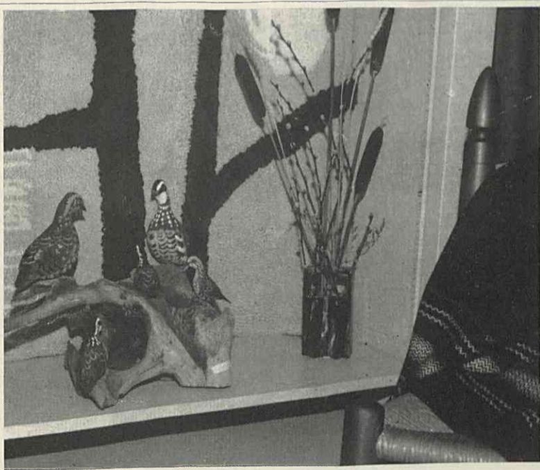
HAND CARVINGS of native bird life, an intricately-hooked rug, ceramic ware, a chair in hand-rubbed native woods, and a hand-woven coverlet are but some of the products you'll see at such well-known centers as Allanstand, Candlelight Crafts, The Spinning Wheel, and Guild Crafts in and near Asheville and at Moses Cone Memorial Park, Blowing Rock.

Firestone people regard the company relaxation facility as ideal in its mountain setting. What's more, the camp is a takeoff base for countless side trips into the Southern Highlands, one of America's richest sightseeing regions. An example of things to see is the hand-craft displays.