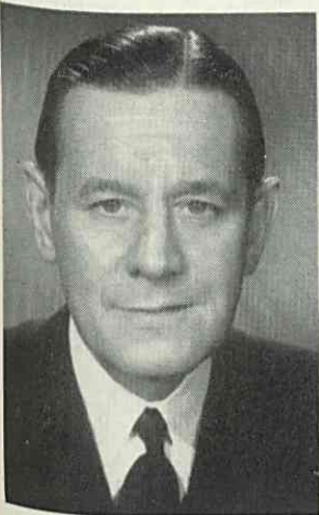
Harvey S. Firestone Jr.