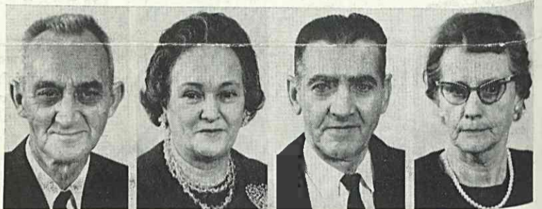
Lake T. Quinn Weaving (syn)