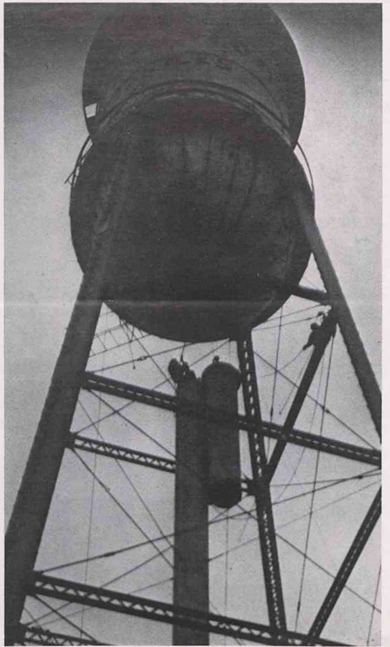
This photo in late December shows workmen (one in center upright pipe and another on top right crossbrace) as they began to remove the pipe by sections.

In recent years when the plant switched to other water sources, the tank-on-legs was no longer needed.