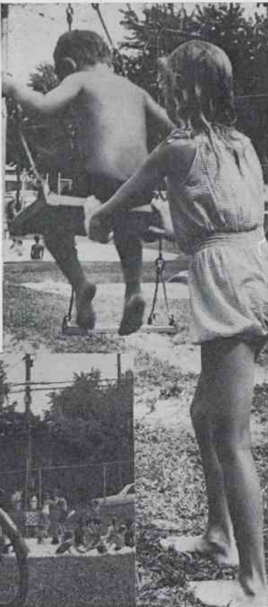
• Playground Fun: Splashing and Swinging

Ceramics art offers decorating and finishing instruction and 'do-it-yourself' craft each Tuesday evening in the building inside the playground area at Dalton and Second Avenue.