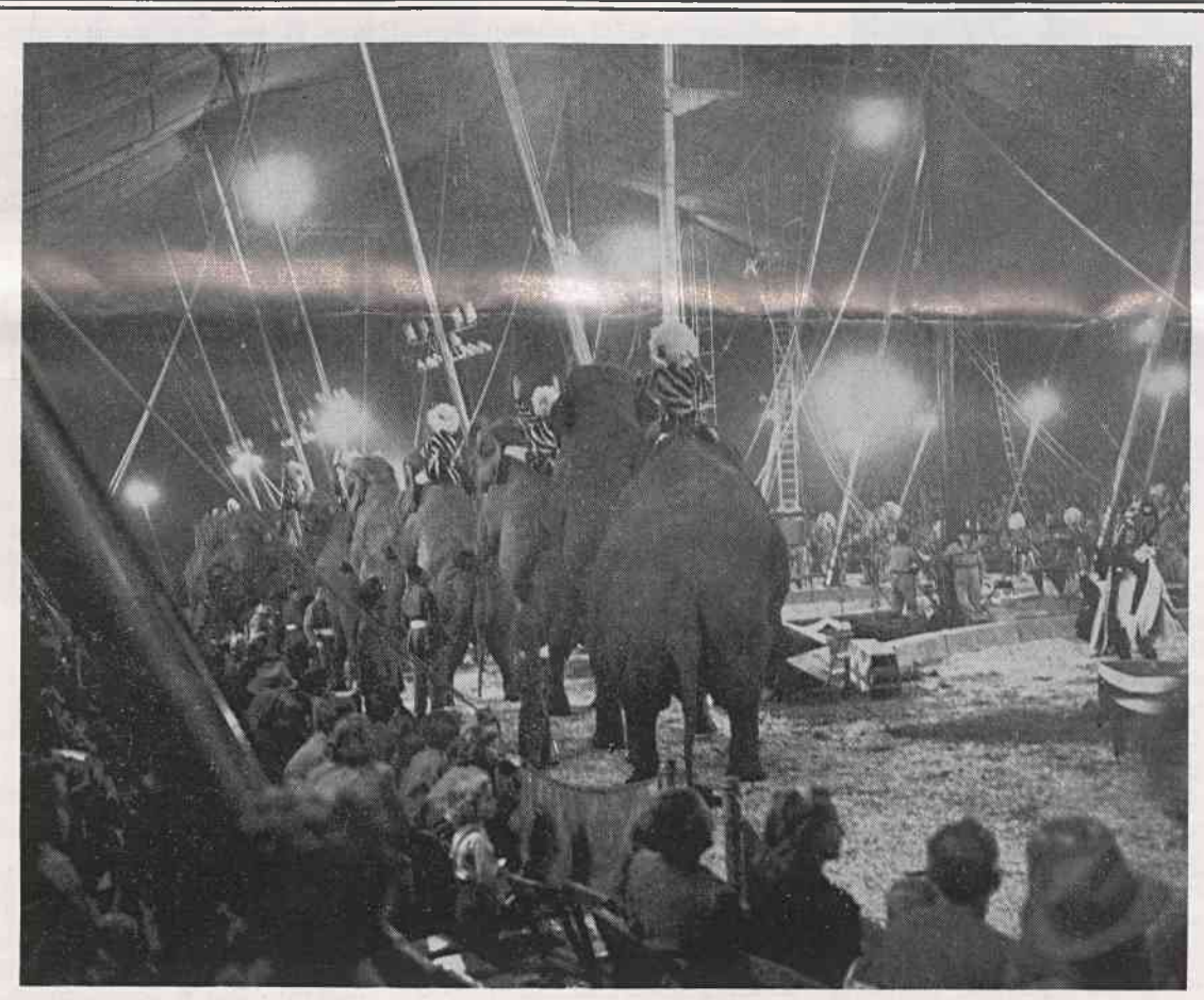
25 YEARS AGO