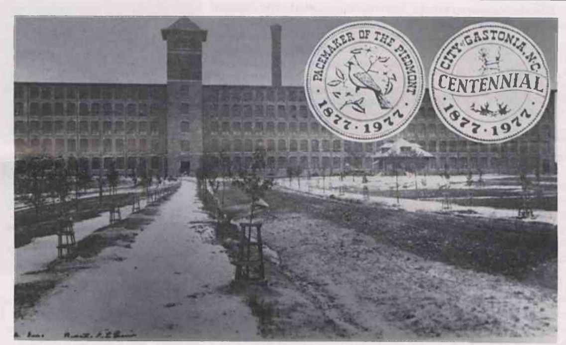
•• This early-1900s scene of old Loray "Big Mill" at Gastonia is featured on a ceramic platter commemorative of the May 100th anniversary of Gastonia as a chartered municipality. Old Loray, later Manville-Jenckes, has been owned and operated as a Firestone fabric manufacturer since 1935.