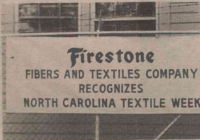
SIGN IN FRONT OF GASTONIA PLANT