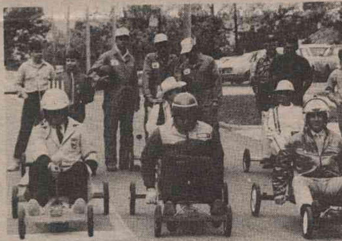
ON YOUR MARK. GET SET...