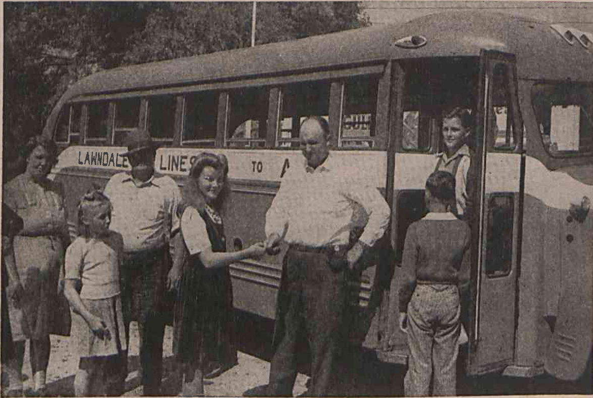
Oph Hunt's new addition of the Lawndale-Shelby Bus Line.

Published for OUR BOYS in the service by the folks back home.