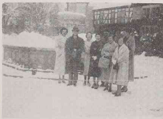
PAI, AAA and Sabena Employees

The following day we motored to the Taunus and Rhein district and visited the Kronberger Schloss for dinner. This castle was built by Empress Friedrich, Mother of Wilhelm II in the year 1888. Aside from the large drawing rooms and banquet halls on the ground floor, 30 rooms with a total of 50 beds are available for hotel purposes. Dot fell down the Castle steps, not hurt, but don't you think it's an honor to fall down castle steps? We visited another old castle with vine covered walls actually occupied by knights and their ladies. A