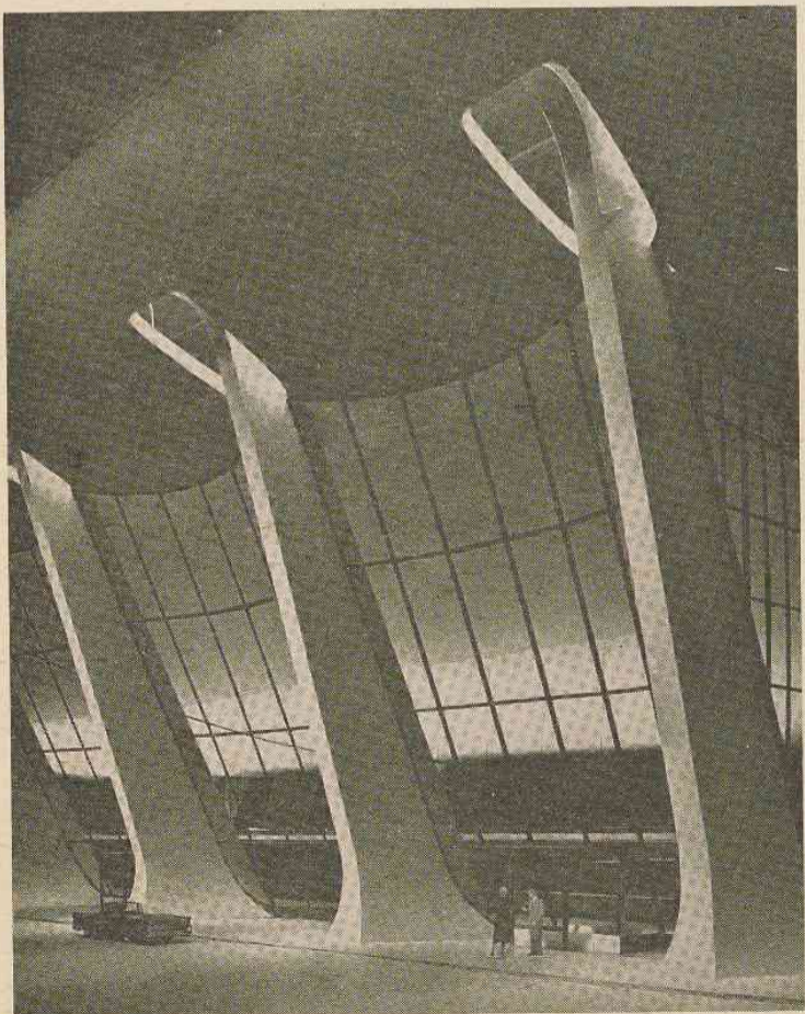
AND THE NEW airport at Washington, christened Dulles International, is rapidly taking shape. Although the photo above is of a scale model and not of the completed Dulles Airport, construction of the runways has already begun and operations should begin in early 1961.