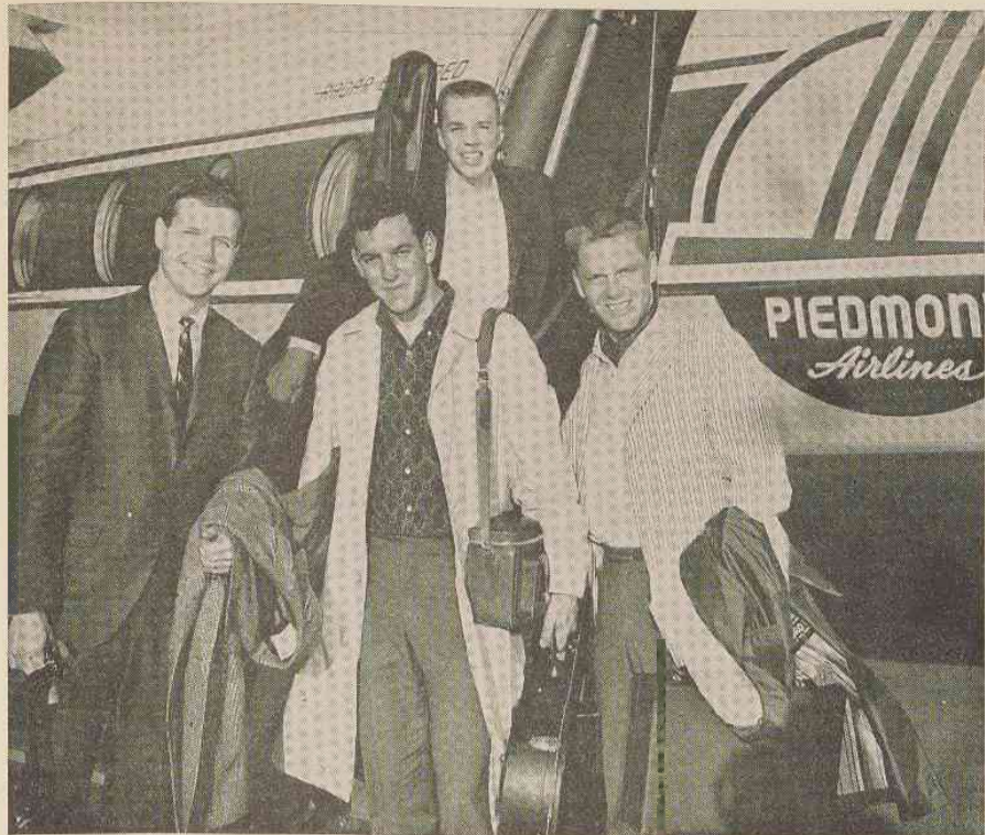
THE BROTHERS FOUR pictured as they board their flight in Lynchburg. The vocal group was in town for a recording date at a local college. They also flew Piedmont last fall when they were giving a performance at the University of Virginia.