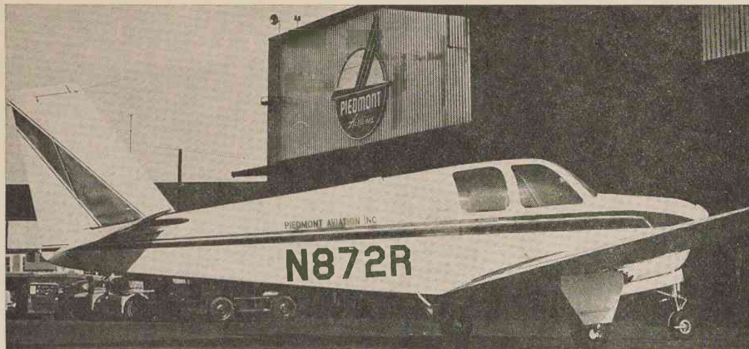
The executive sales division now has its own Beechcraft Debonair for use in traveling and contacting business aircraft operators. Color scheme of the airplane is white with red trim outlined in black.