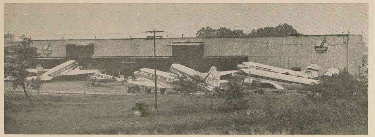
Eight—Count 'Em—Eight airplanes recently jammed the INT maintenance hangar, setting a new record. Seven of them were executive and corporate aircraft in for inspection and overhaul, and constituted the largest number ever at INT at one time. Companies represented are (left to right): Champion Spark Plug, Coble Construction Co., Union Bag Co., R. J. Reynolds Tobacco Co., and Charlotte Aircraft (two planes, far right), and in the hangar, Cook and Co., and Piedmont's F-27. All the aircraft are DC-3's except for the F-27 and Coble Company's E18S Beechcraft.