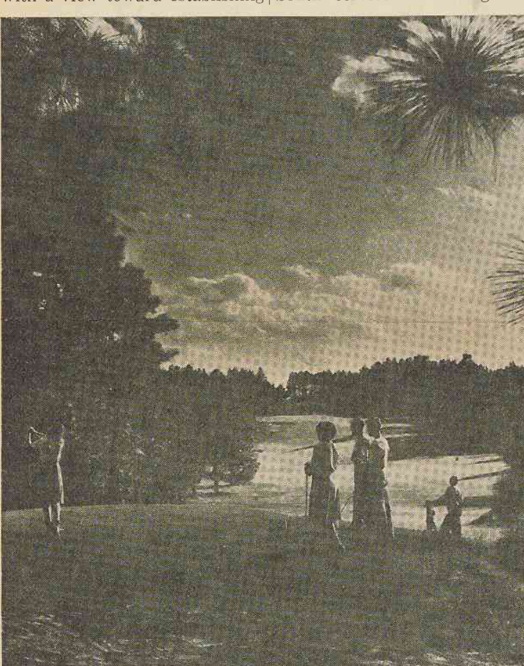
Large, championship golf courses are among the prime attractions in the SOP area. A mild climate and low humidity make the Sandhills a year-round golfing resort.