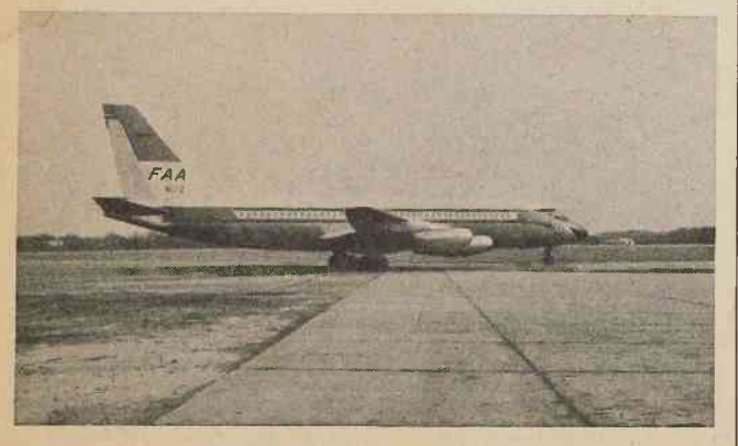
FAA's Convair 880