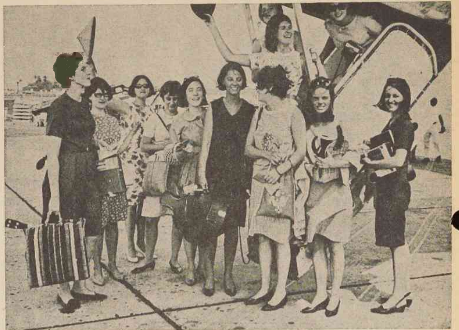
OFF TO A FLYING START — These Hollins College girls left ROA via Piedmont for SDF. Then they travelled on to PUK where they boarded a raft for a 950 mile journey down the Mississippi. The modern Huck Finns (gal style) ended their voyage in New Orleans ready to mix business with pleasure. For Sale: one raft, stout timbers supported by oil drums, $1,800.