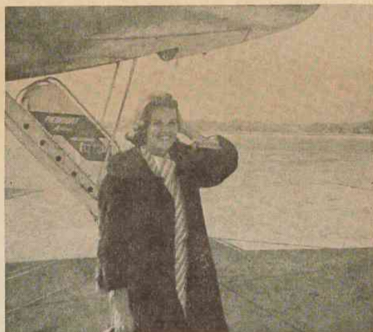
NO PEPSI'S ON BOARD — Anita Bryant didn't seem to mind. She posed here as she passed through Roanoke in route to a convention at White Sulphur Springs, West Virginia via Piedmont not long ago.