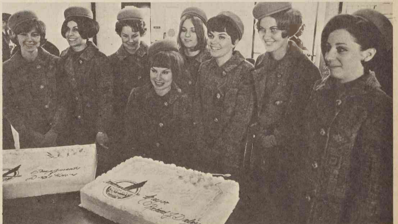
JUST ONE OF MANY welcoming gestures on behalf of Chicago's Mayor Richard J. Daley were the Piedmont cakes on hand for the arrival at Midway. The smiling onlookers are the stewardesses that