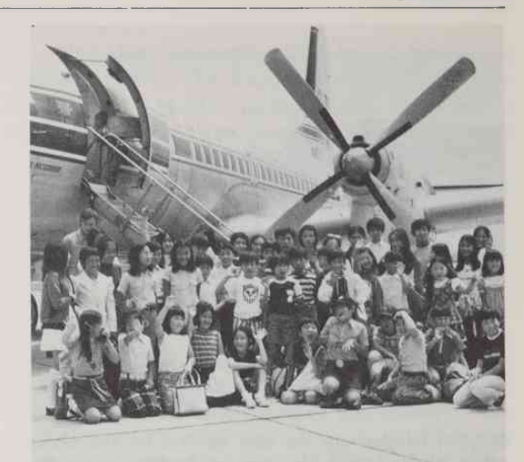
Most of our stations know about the large number of summer camps on our system and the corps of campers who fly with us to these retreats. Each year the Eastern Association Coal Corporation opens the doors to its camp in Hinton, West Virginia to the children of representatives of foreign coal companies in the U. S. This group of Japanese children, after leaving home thousands of miles away, completed the last leg of their trip on a Piedmont Japanese built YS-11, just like meeting an old friend on the other side of the world.