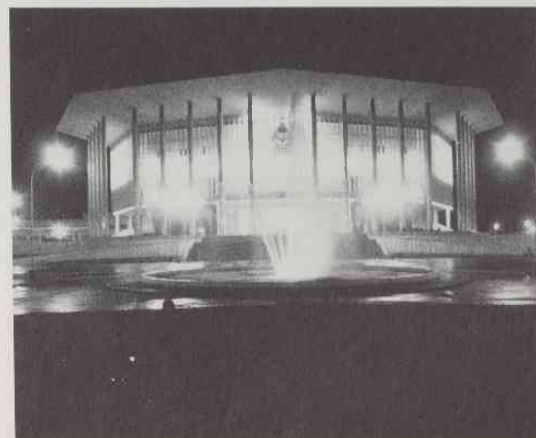
As modern as tomorrow the Bandaranaike Memorial International Conference Hall in Colombo, Sri Lanka is one of the finest meeting places in Asia.

With something like prophetic timing Air India has just announced positive space interline tours to India and Sri Lanka. Their offer includes an eight night/nine day cruise in the Indian Ocean with the ports of call including Bombay, Goa, Colombo and the Laccadives. The total cost is $250 per person and employees, spouses, children and parents are eligible. Sailing dates, from Bombay are January 22 and 30 and February 7. For further information write Air-India, 1666 K Street, NW, Washington, D.C. 20006 or call Ms. Rose Scheer, 202 785-8989.