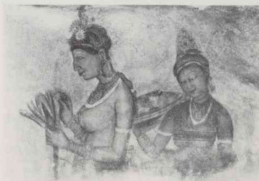
In a pocket of the giant rock are famous frescos of the "Ladies of Sigiriya" and remnants of an enormous gallery of portraits dating back to the 2nd century.

British author-scientist Arthur C. Clarke, perhaps best known as the writer of "2001 — A Space Odyssey", went to Sri Lanka years ago, to write one book about skin diving in the Indian Ocean. He stayed and has described this fantastic place where he has made his home as "a land without enemies." Sri Lanka continues to capture the hearts of its visitors.