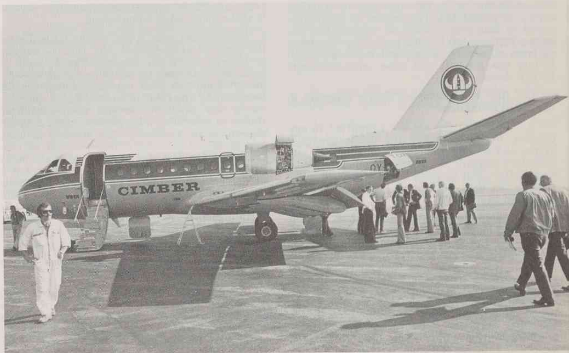
The visiting 614 returned to Cimber Air's main base at Sonderborg, Denmark to begin operation on their domestic network after its first North American demonstration tour.