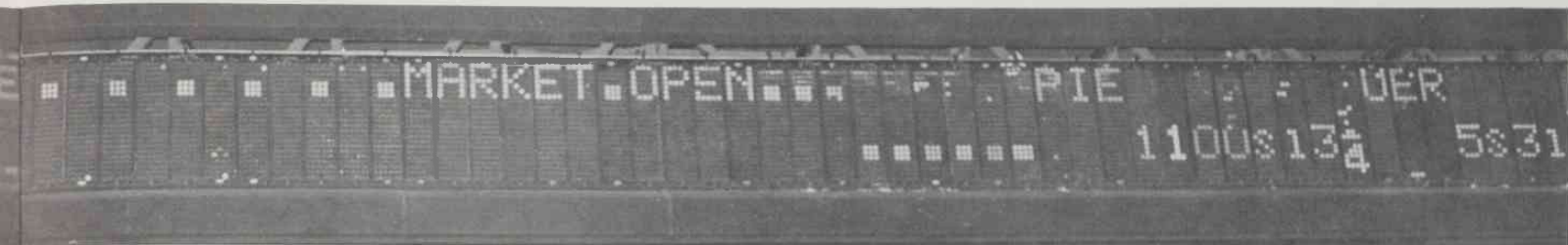
At the New York Stock Exchange, PIE flashed across the ticker with the first trade for 100 shares at 13¼.