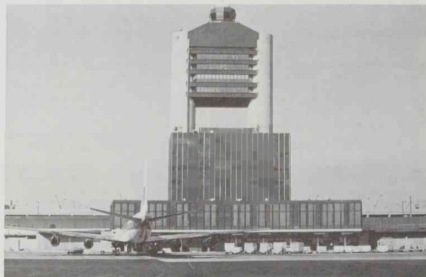
The first flight to Boston was December 1, 1978.