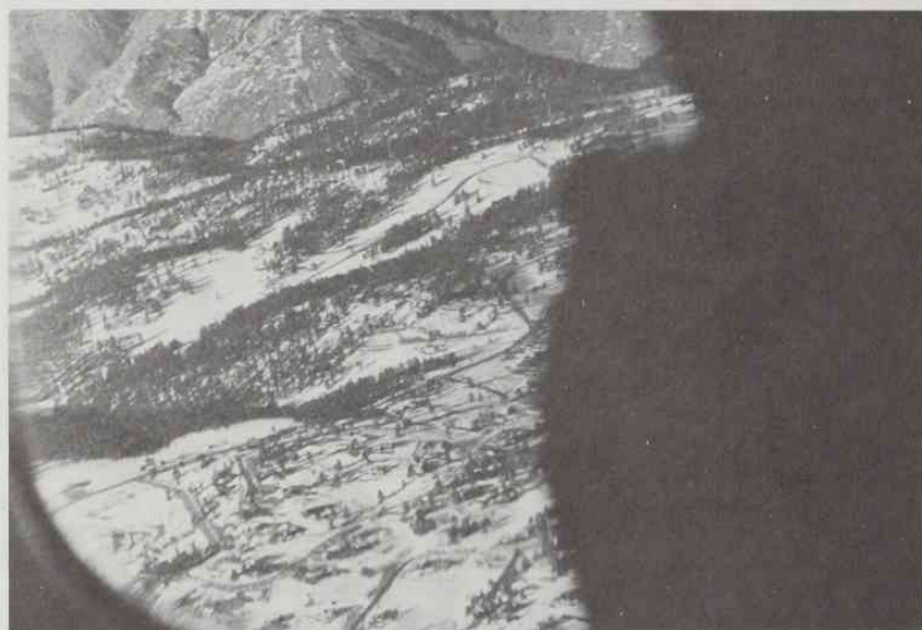
We headed west to Denver on December 15, 1978.