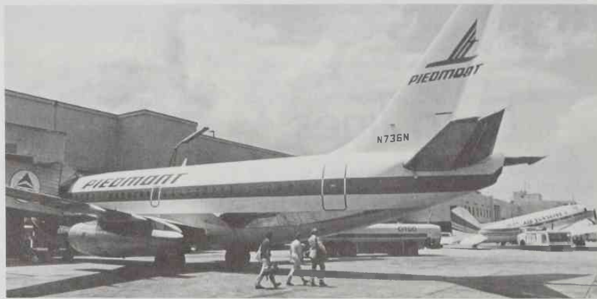
Miami became a Piedmont city on June 15, 1978.