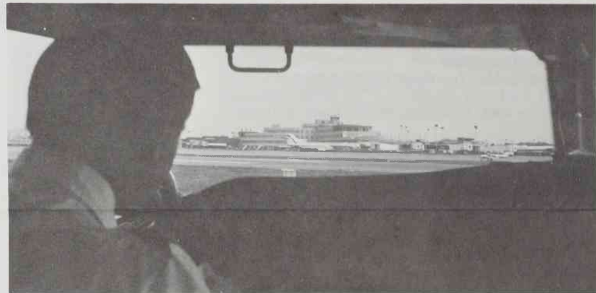
We put Pittsburgh on our map October 25, 1978.