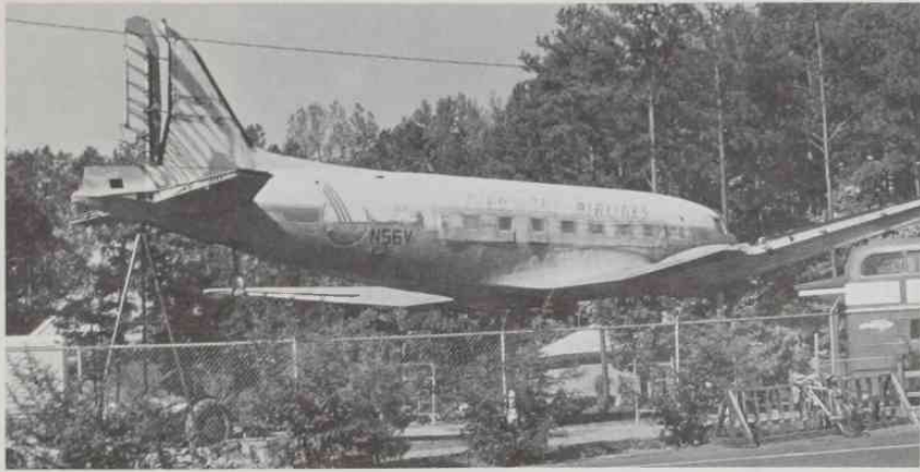
The Company's first Potomac Pacemaker, N56V, is now up on its pedestals at the North Carolina Museum of Life and Science in Durham. Actually, more progress on the restoration has been made since these pictures were taken. The project is scheduled for completion this spring.