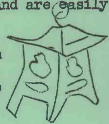
BEPPU IRON LANTERN

HAVE YOU SEEN OUR DAMASCENE JEWELRY? Bracelets, earrings, cuff links, tie clips, necklaces, money clips, Each piece is a miniature work of art. The technique of Damascus Jewelry originated in the pre-Christian era in Damascus and was brought to Japan about 700 A.D. At present this technique remains in existence only in Kyoto, Japan. The process begins by chiselling fine lines on a steel bast. Then 24 Kt. gold and silver are hammered into the design. After corroding the surface, several layers of lacquer are baked on the entire surface. The design is then polished out with charcoal and set in a bezel which is gold plated.