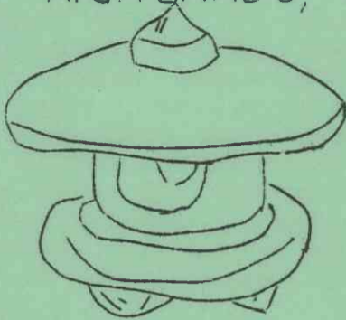
MARU OKI DORO (ROUND) (Granite)