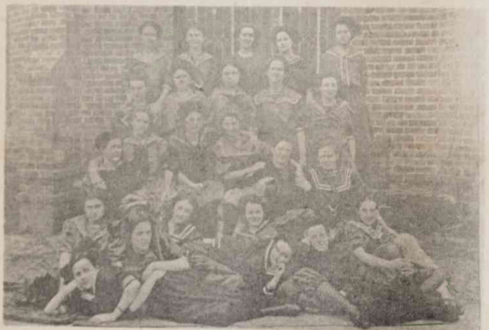
Physical Culture Class Pine Knot 1910