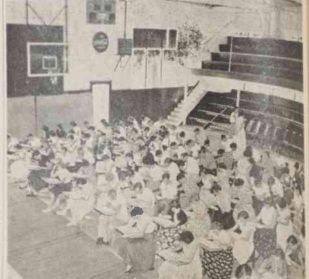
Upperclassmen help freshmen boys check in at Caldwell Hall.