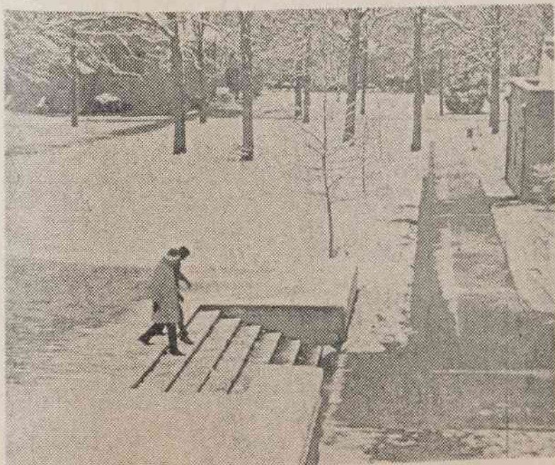
WHITE WEATHER —The weather ended the exam week with a fitting surprise. Starting Friday and continuing into the first days of semester break, nearly nine inches of snow fell on the campus, and transformed it into a place of white beauty.