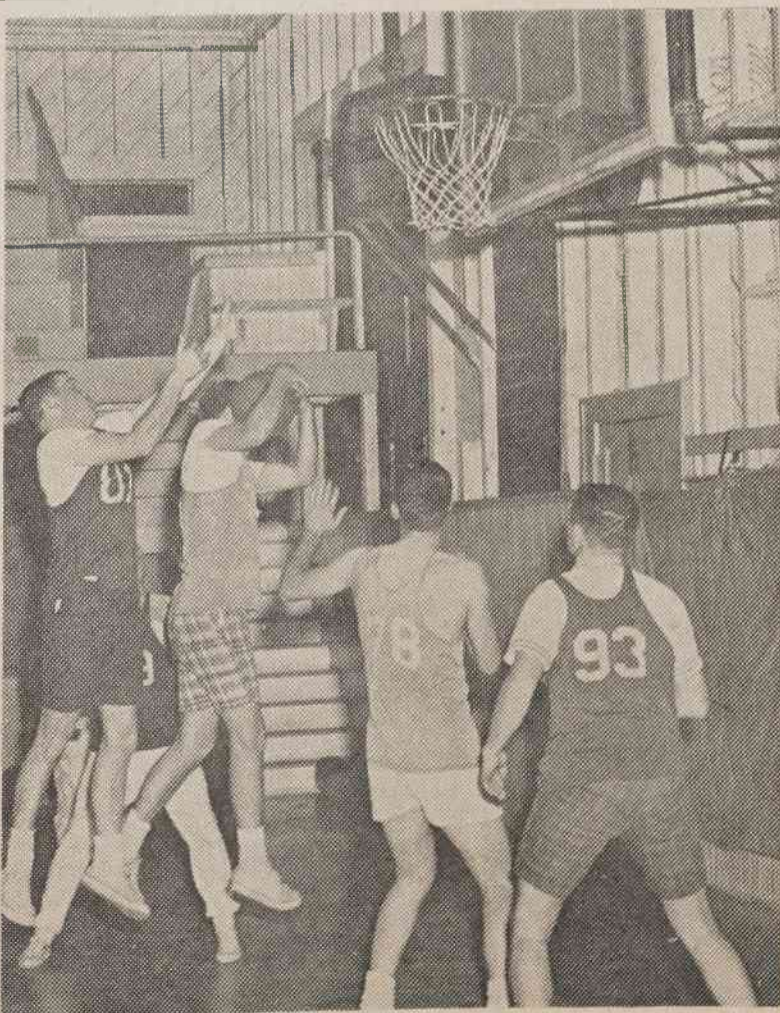
INTRAMURAL BASKETBALL—Shown above are some of the players in the intramural basketball game between Hackney B team and Delta Sigma Phi B team. The Hackney squad won by a substantial margin.

Once the Constitution has received the approval of the Cooperative Association the final step will be obtaining the approval of the Board of Trustees. The Trustees will meet on Feb. 24 and will consider the Constitution at that time.