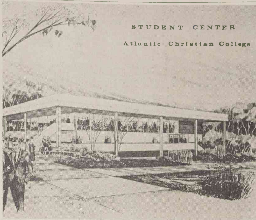
NEW STUDENT UNION —Atlantic Christian College has received final approval of a HHFA loan in the amount of $450,000 to be used toward the construction of a new student center. Work on the new structure is expected to begin this summer pending acceptance of satisfactory bids. The student center will house a new cafeteria, book store, post office, and student lounge and recreation areas.