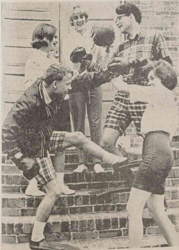
BASKETBALL BONANZA —A Basketball ball bonanza will be featured by the Freshman Class this Thursday night in the gym at 8:00. Certain members of the class are shown above as they prepare for the battle. It will see the boys play the girls with the boys wearing boxing gloves and swim flippers.