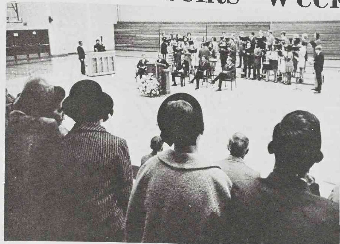
APPROXIMATELY 700 PARENTS attended annual Parents' Weekend held Saturday and Sunday. The guests attended a symposium, shown above, held Saturday afternoon and were entertained by the ACC Chorus.