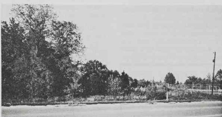
This land is between Gold Park and the college tennis courts, an ideal spot for six new badly needed courts.