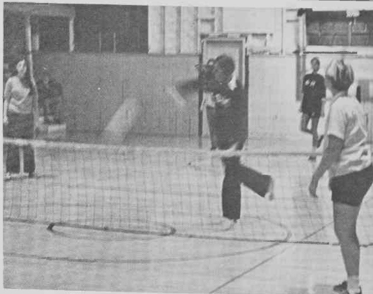
Low net for the girls?—No, the low net is why this girl's intramural game is called VOLLEY-TENNIS. Using a regular volleyball, a tennis height net, and played in the gym, the game employs rules very similar to volleyball.