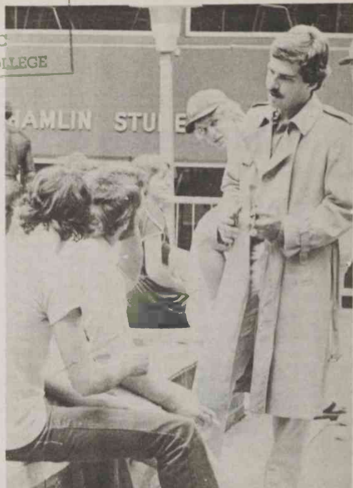
Tom MacNamara, co-star of "P.M. Magazine," is shown chatting with AC students around the fountain.