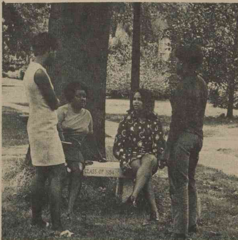
These Sophomores are trying to find their "Learning Tree."

The eye of the photographer once again catches the many changing faces of Bennett College. Students, teachers, parents and others are all in the action and all an intricate part of the Bennett life. The camera has peeked into group discussions, gossip sessions, teacher-student dialogues and other situations which are connected to the Ben-