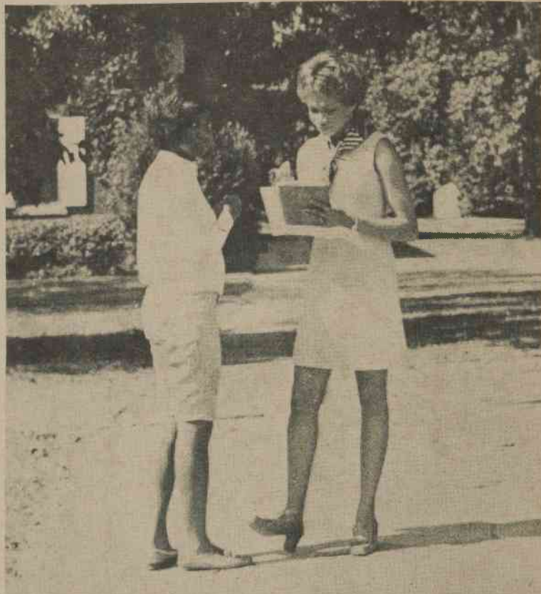
Let me write down those assignments. I haven't been to class in the last few weeks.