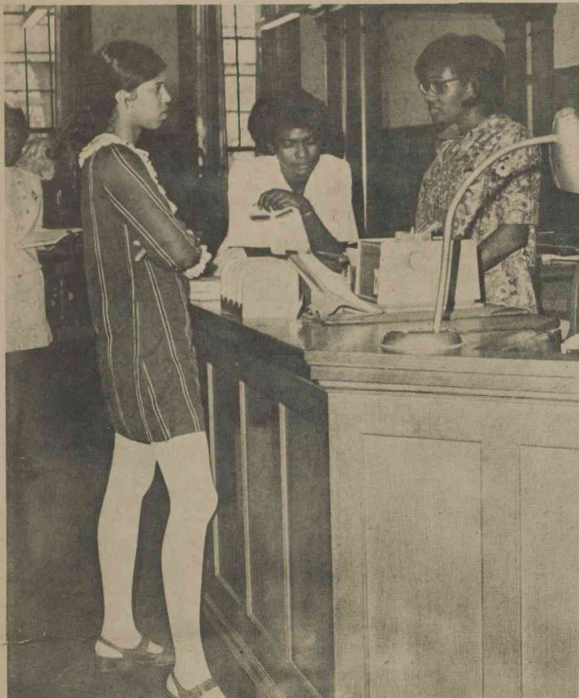
"You mean you don't have your library card?"