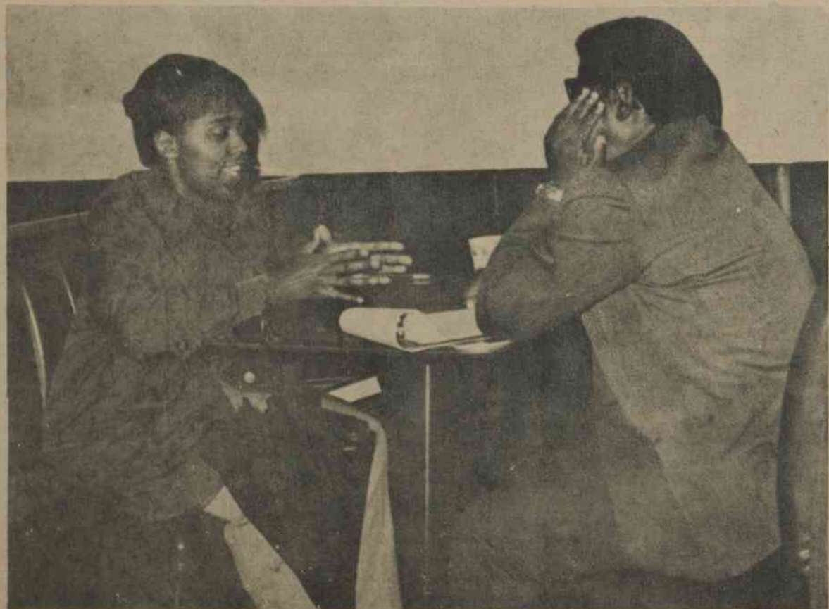
Now the learned learns from the learner.

job is engineering physics, photography takes up much of his time. Between his studying, his job as chief photographer for the A&T Register and working for the Bennett public relations office, he has little time for anything else, except maybe a girlfriend. So, if a good looking young man approaches you with a camera, smile.