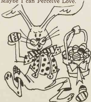
We couldn't find Santa so here's the Easter Bunny. Merry Christmas anyhow!

I cannot perceive just who you are And where we are going to; Can I bear life the way it is Or living it with you? I cannot perceive just who I am And whence I first drew breath; Or how I can live so fruitful a life Only to be met by death. I cannot perceive just who He was Or when She first Conceived; And how man makes it seem ideal To lie and cheat and steal. I cannot perceive you nor me Or God in His Heaven above; I cannot perceive Death or Life Maybe I can Perceive Love.