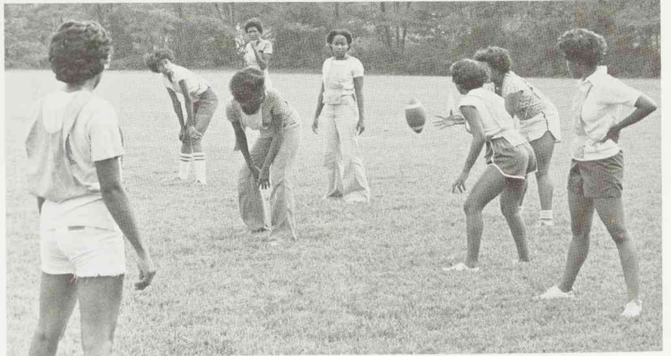
Player Hall versus Barge Hall in a hard game of flag football.