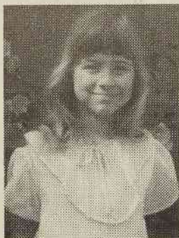
Easter 1987, Age 5