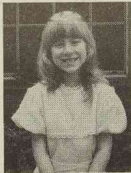
Easter 1988, Age 6