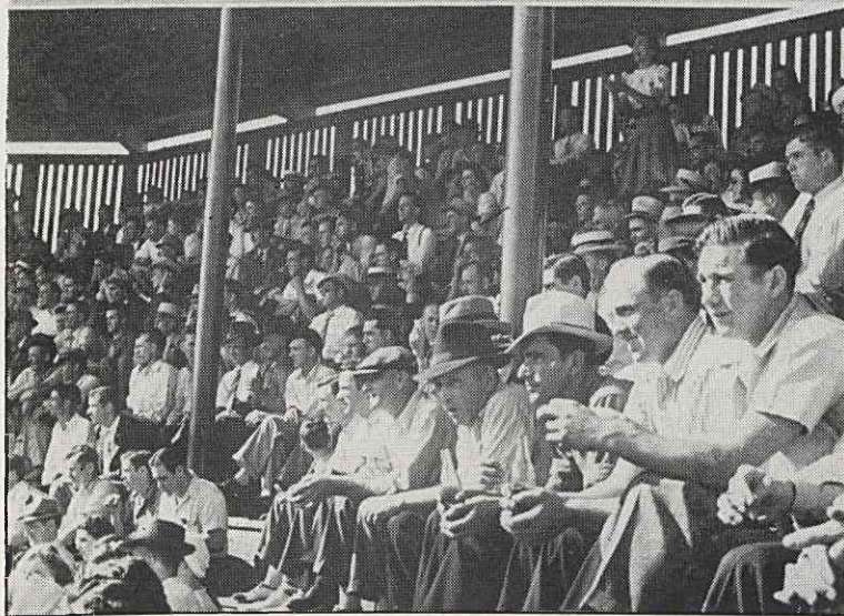
Hundreds of fans were present to see the Blanketeers meet the University of North Carolina on Saturday, May 25, the game marking the dedication of the Company's modern new ball park. Top photo shows the grandstand and a portion of the bleachers as the game progressed. Bottom photo is closeup of a part of crowd which jammed the grandstand. Carolina won the game 7 to 4.