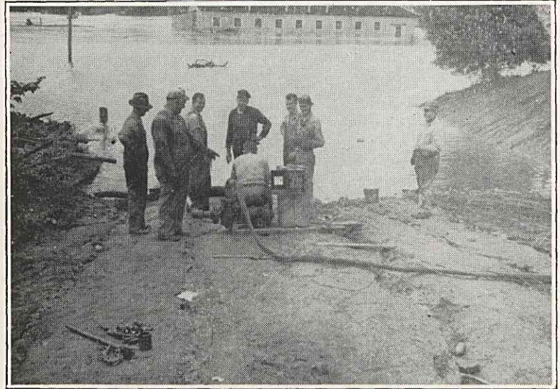
Several men from the Shop are pictured pumping water from the rising backwaters of the Yadkin to the power plant