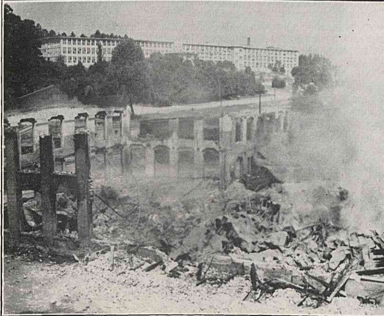
AFTER 47 YEARS OF SERVICE —Top scene was photographed as fire destroyed our scouring plant the night of September 6. Flames are shown pouring from second story windows as firemen and Chatham employees fought valiantly to prevent the conflagration from spreading to the west wing of the building. Bottom photo shows water-soaked, fire-scarred ruins of the scouring plant the morning after the blaze. Standing high upon the hill in the background, safe from floods that have caused much damage to the now gone "old mill," stands the main plant of our Company.