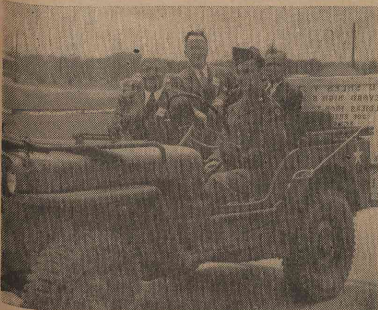
Yes, Sir, He's Riding In An Army Jeep