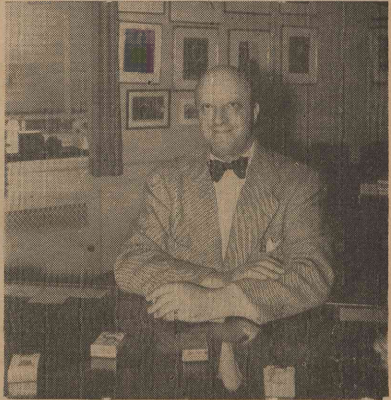
In His Office At The Plant