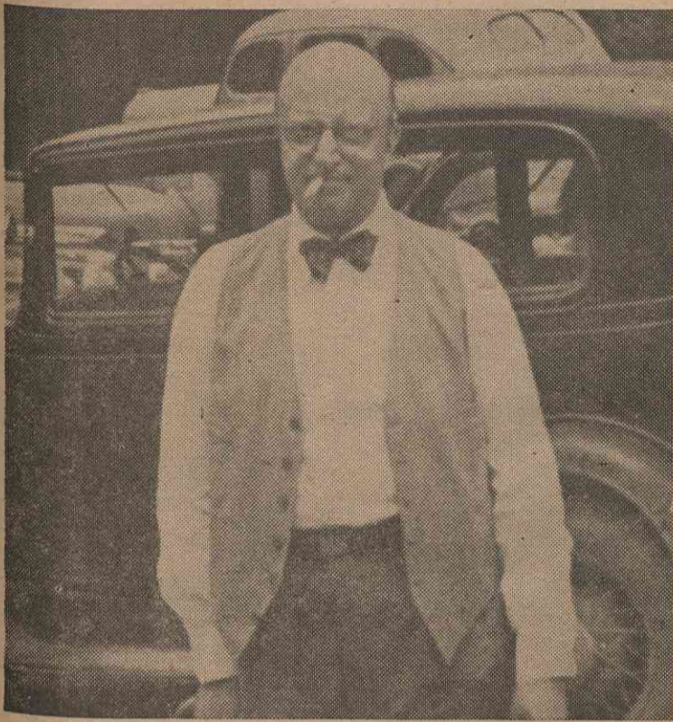
Enjoying Our Annual Ecusta Picnic