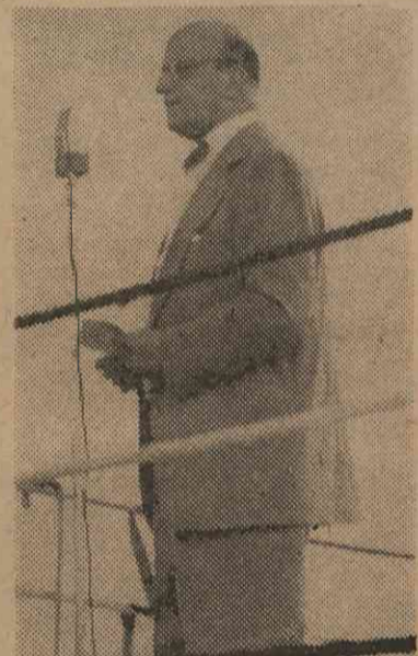
Making A Speech

He doesn't have much time for it, but the "Boss" really likes to play as well as work.