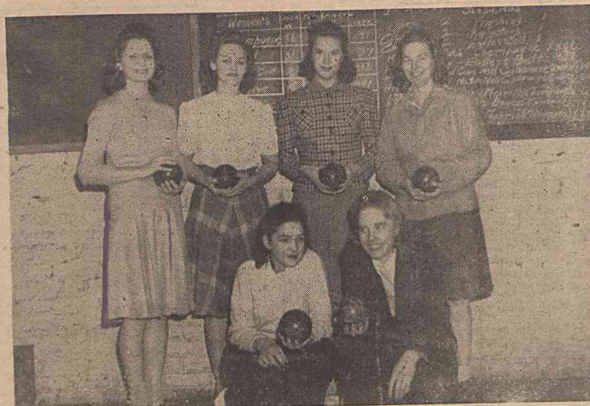
Captains Of The Six Teams In Women's Duck Pin League