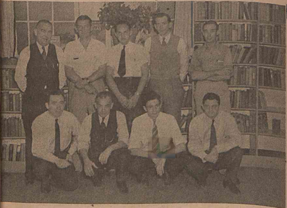
Maintenance Is Now Pushing Office For Fourth Place