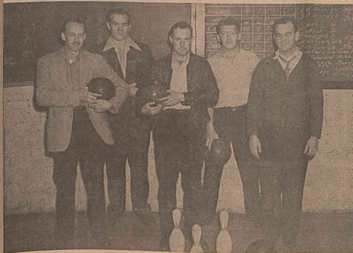
Machine Room Is Pushing Champagne For First Place