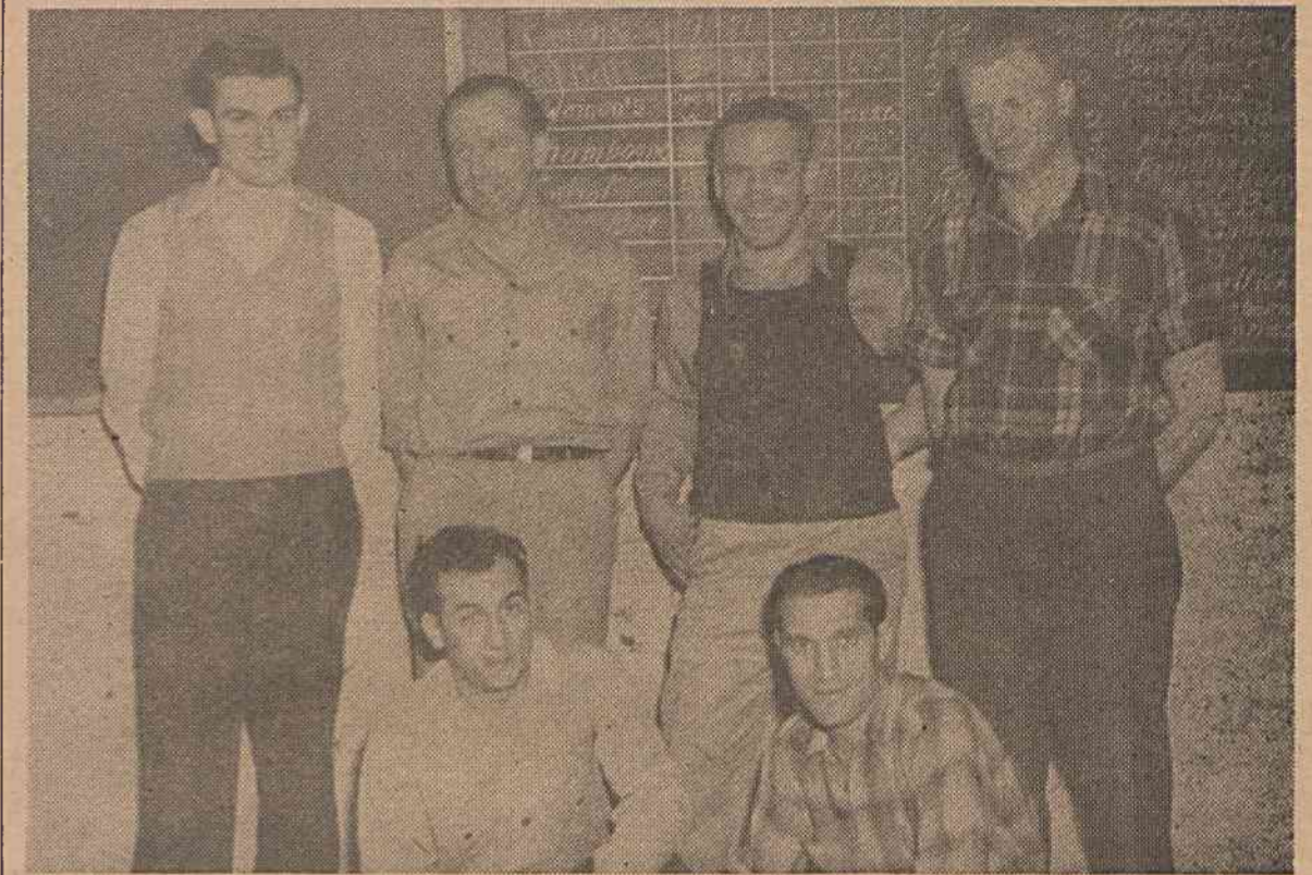
Refining Room Bowlers Are Extremely Good Sports