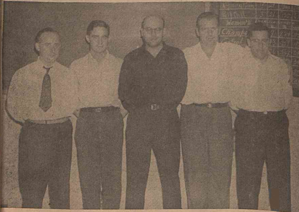
These Office Team Bowlers Really Enjoy Their Bowling