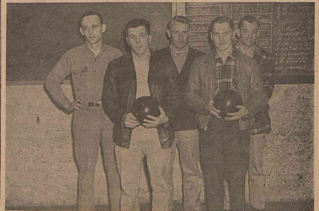
Here Is The New Team In The League, Pulp Mill Boys