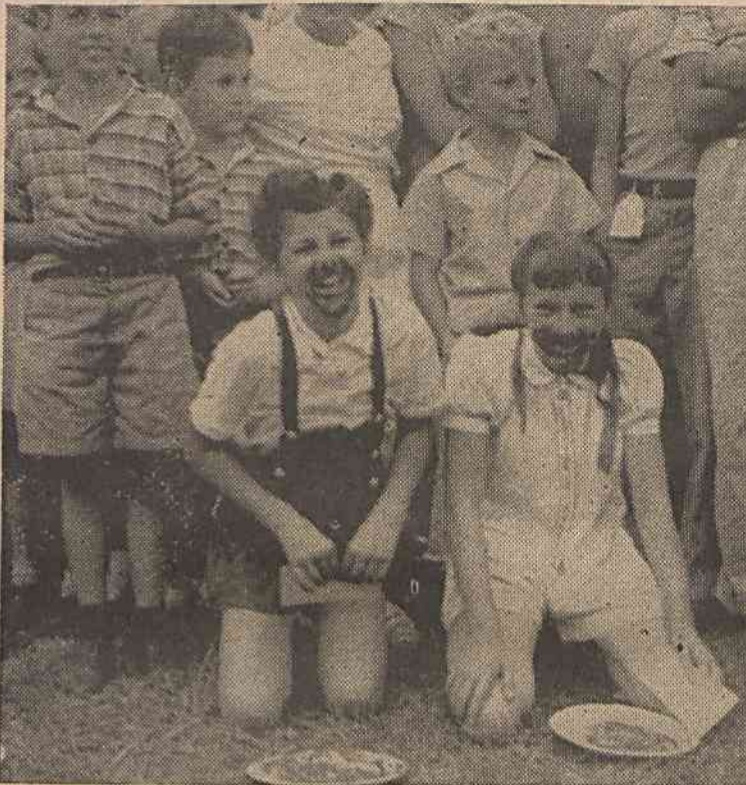
You can look at these young girls and tell that they had fun participating in the pie eating contest. You will note that their plates are empty and that there's a little chocolate pie around their mouths.