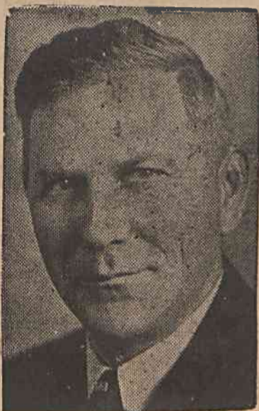
GOV. GREGG CHERRY

GOV. GREGG CHERRY, shown at the left, will be the guest speaker at the Harvest Festival that will be staged Friday night, September 21, starting at 8 o'clock. Inspection of exhibits will be featured from 2 o'clock in the afternoon until 8 o'clock that evening. At that time special entertainment will be given and Gov. Cherry will speak at 8:30. Prizes will be awarded following his address and the rest of the evening will be devoted to refreshments and square dancing.