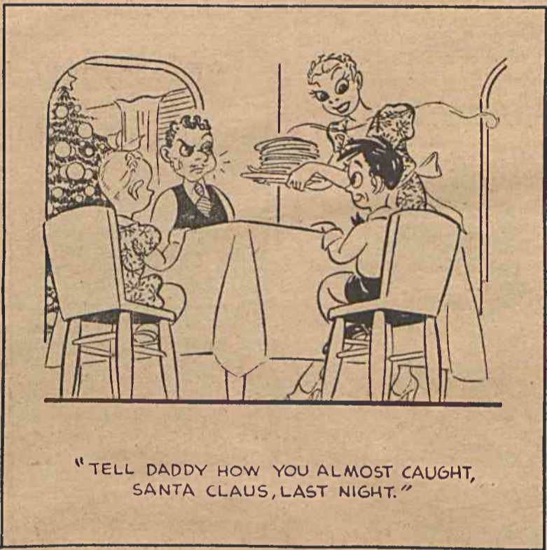
"TELL DADDY HOW YOU ALMOST CAUGHT, SANTA CLAUS, LAST NIGHT."