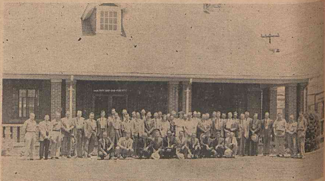
The above picture was made of the group of engineers representing the Engineers' Club of the R. J. Reynolds Tobacco company of Winston-Salem just after they had had lunch in the Cafeteria. The group made a tour of the plant and were complimentary about what they saw. They made the trip from Winston-Salem to Ecusta by bus.