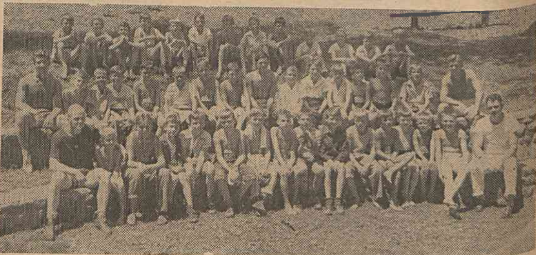
These boys are apt to be excellent athletes. They attended the coaching school at Camp Sapphire and learned a great deal about the basic principals of touch football, volley ball, boxing, softball and shuffleboard.